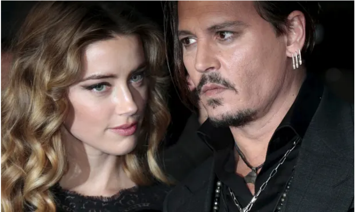
Amber Heard and Johnny Depp settled their contentious divorce on Tuesday.

The actor says she plans to split money from the divorce between a charity for sick children and another that will use it to combat violence against women