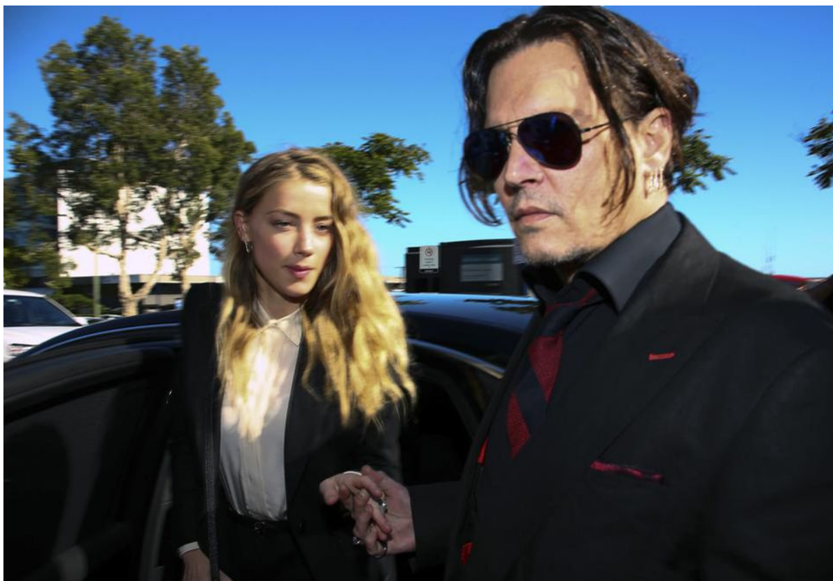
Johnny Depp and Amber Heard back on April 18, 2016 arriving at an Australian court hearing over... [+]

While Heard's donation of her settlement payment is undeniably admirable, depending on the way the settlement was structured, it may well yield an untenable tax situation.